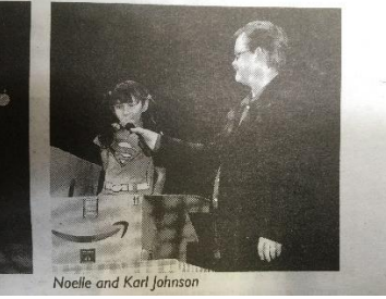
Above is a newspaper photo of her appearing from a formerly flat box to an audience of around 300. She followed that with a growing straw effect and the Peanut Butter and Jelly routine.

Since our next meeting is in early April, in keeping with "April Fool's Day," the theme will be "Sucker Tricks." It promises to provide quite a few surprises.