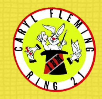
click logo for website

Regular meetings are on the 1st & Board meetings on the 3rd Thursdays' of each month at 7 pm, when not in person click: RING 21 ZOOM Meetings