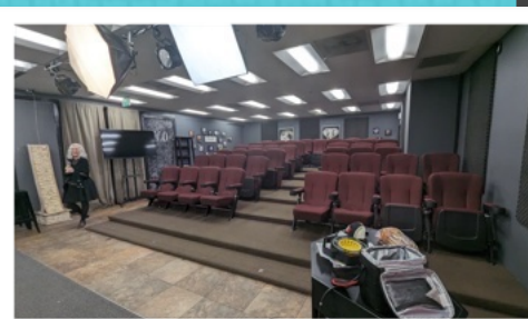
next meeting place