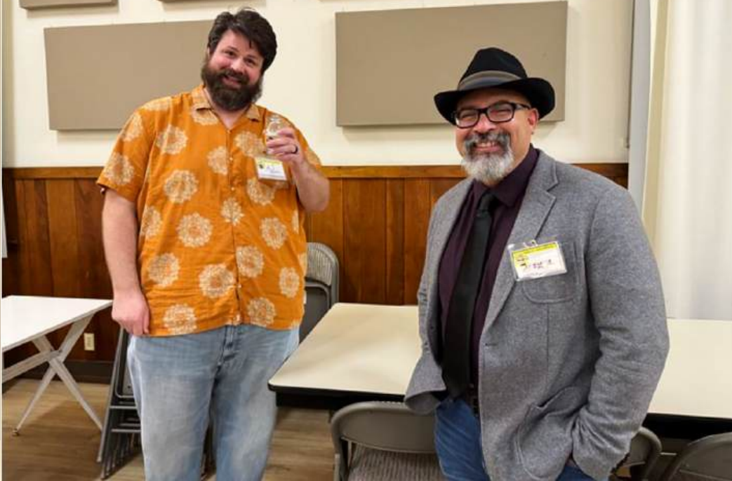
Strolling Magic 3-4-2026

To See Lots More RING 21 Photos and Videos click here